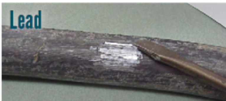
You have a lead pipe if...

Your service line material is either lead, galvanized steel, copper or plastic/PEX. You can perform some tests on the private side of your service line to determine the material.