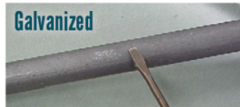
You have a galvanized pipe if...

The Tapping Test ...tapping a coin on the pipe makes a metallic ringing noise.