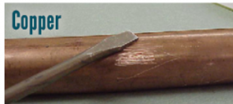
You have a copper pipe if...

The Tapping Test ...tapping a coin on the pipe makes a dull noise.