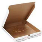
Food Contaminated Items (Pizza boxes, paper plates, napkins)