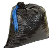
Garbage or Yard Debris