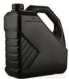
Containers for Hazardous Materials