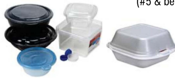
Plastic & Styrofoam Food Containers, Lids & Loose Caps