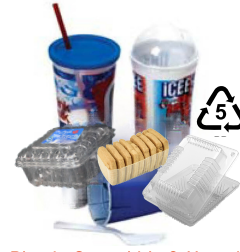
Plastic Cups, Lids & Utensils (#5 & berry/clamshell containers)