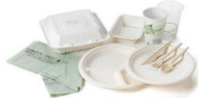
Compostable Cups, Plates, Utensils & Bags