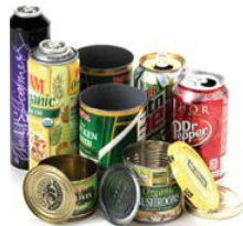
Aluminum, Tin & Empty Aerosol Cans