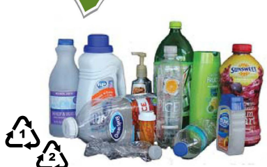
Screw-Top Plastics (with caps) & Yogurt and Margarine Tubs (no lids) #1 and #2 plastics; NOT #5