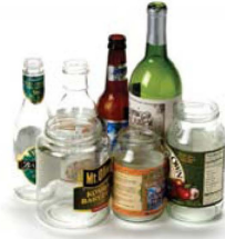
Glass Jars & Bottles (All colors)