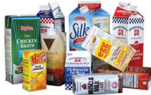
Paper Food Cartons (no caps) (not cylinder shaped)