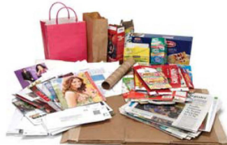
Newspaper, Glossy Inserts & Magazines Mixed Paper (Junk mail, phone books, envelopes) Cardboard (Break down, cut to fit & bind)